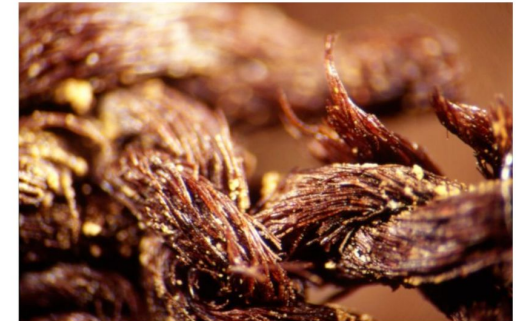
Resin-saturated yarn, microscopic image.

Yet our Bolton Study Day not only looks at the importance of Bolton's Egyptian collection, its unique blend of workshops provides the opportunity to get up close and learn at first hand.